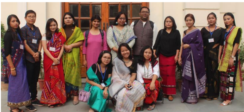
Pics of and during the Symposium