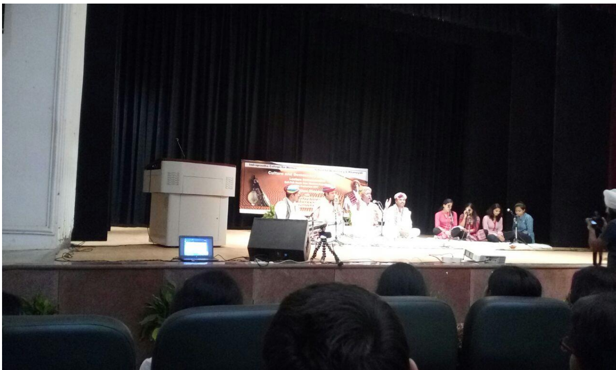
Performance of Manganiar Singers at I. P. College

Along with the demonstration, the event also highlighted the work of Bulleh Shah, a Punjabi Muslim philosopher of Mughal era who, through his music, criticized the misuse of Islam and its ideologies by the Muslim clergy of that time. The programme talked about the socio economic problems faced by the Manganiar and the Langa community, and the threat of commercialization of musical heritage which has affected the artists and their traditions leading to a deep economic crisis. The instruments themselves are a part of their identity and intrinsic to their performances. These communities of folk musicians which consist of Muslims have been performing for Rajput patrons for decades but have nevertheless been recipients of the injustices of the prevailing caste system. The event thus sought to bring about a greater awareness which could contribute to the efforts of preserving this form of music.