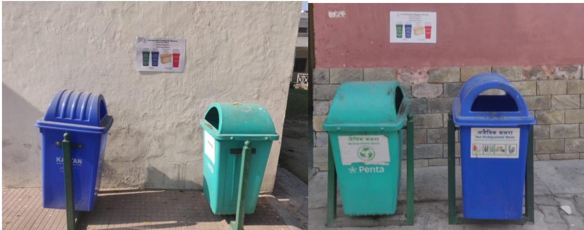
Posters put up near the bins