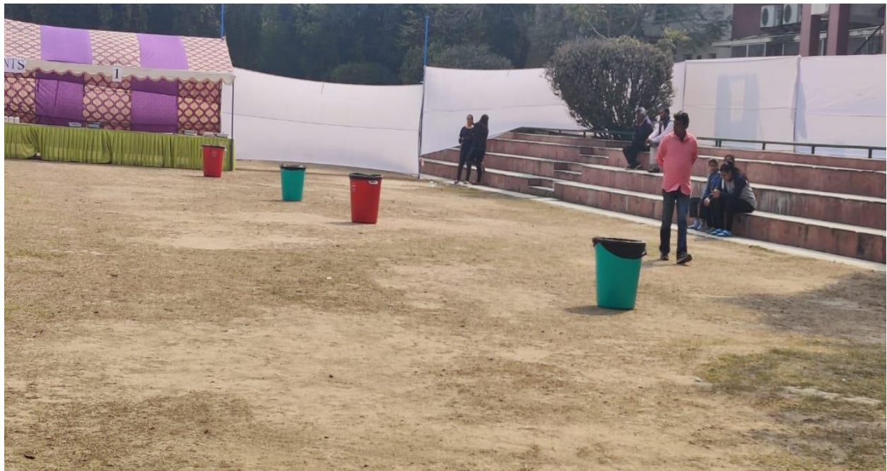
Placement of bins in the Sports Field where lunch was served

Indraprastha College for Women celebrated its 97 th College Day on 7 th February 2020. The occasion proved to be a golden opportunity to increase awareness about 'Project Nidaan'. The Department of Economics ensured that volunteers were present in the Sports Field where lunch was being served. Waste disposal was a major concern. A good number of bins were placed in the area and all these bins were guarded by the volunteers. Apart from students, the volunteers got the opportunity to interact with parents, teachers and other guests. They were told about the initiative being taken up by the College.