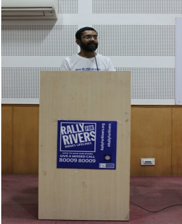
d) National Voter's Day