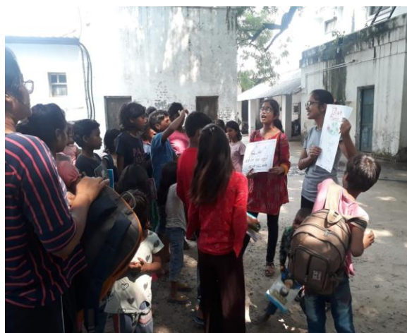
At the adopted Slum