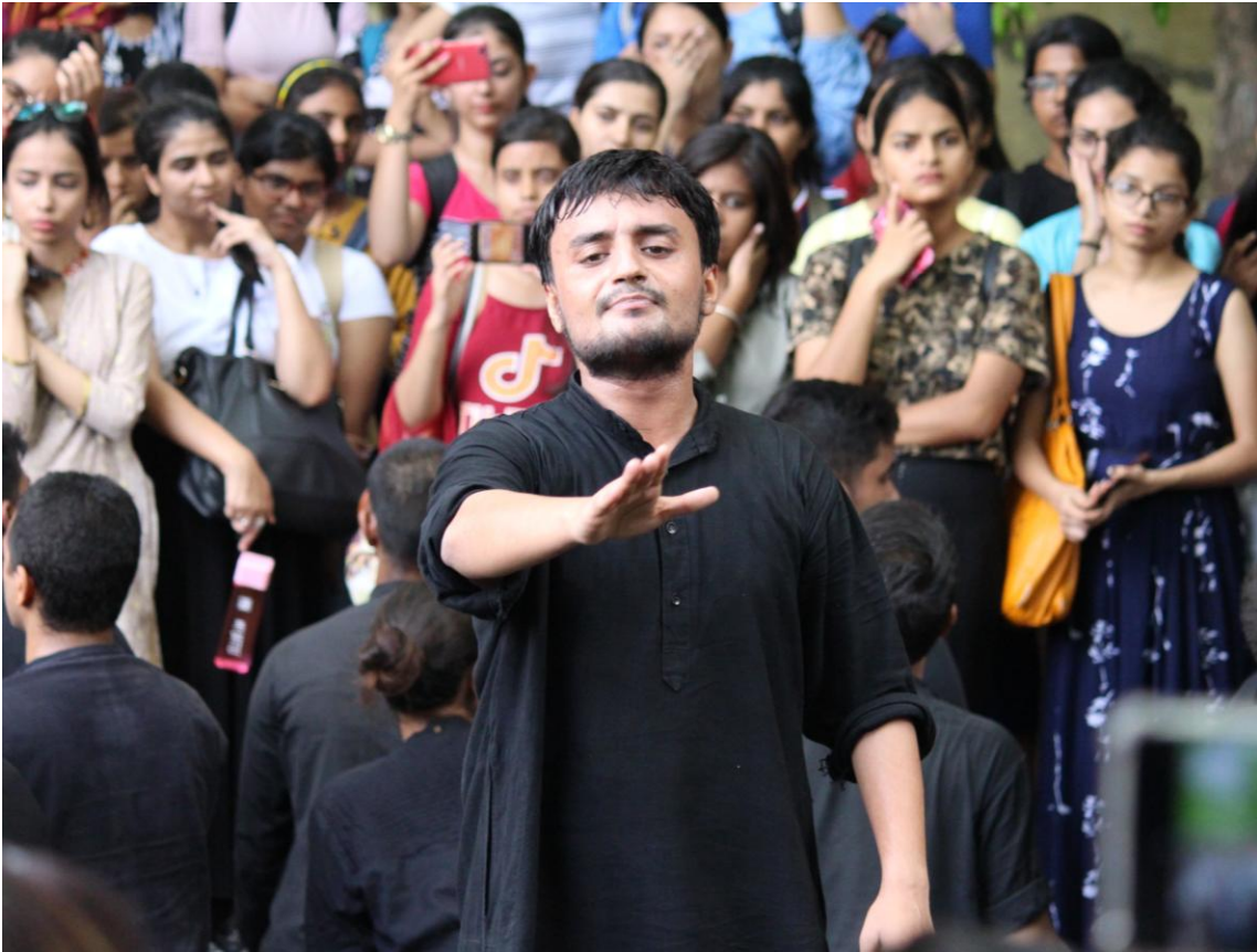
Artist from Sukhmanch theatre performing in IP