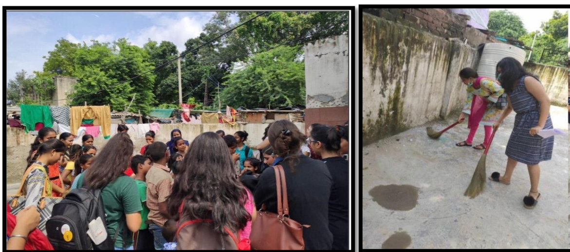
Few glimpses of the event-

On 6th day, for around 3 hours, 8 volunteers went to the slum area in Khyber Pass and spread awareness about personal hygiene and cleanliness. On day 7 th : 8 NSS volunteers conducted cleanliness drive for around 3 in slum area was organized.