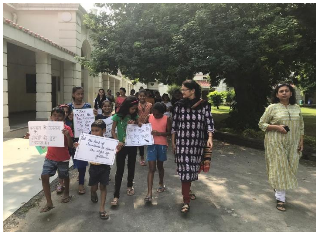
Inside the College with the College Community