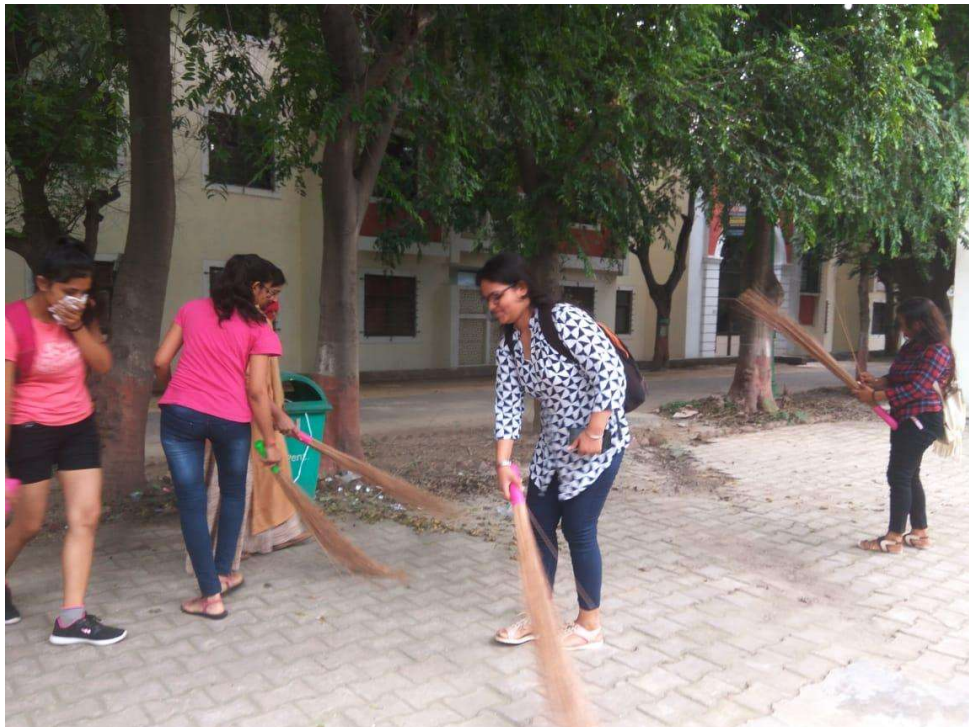
Sweeping around the KG Hostel.

In the cleaning drive conducted inside the college seventeen volunteers participated with cheer for around two hours .