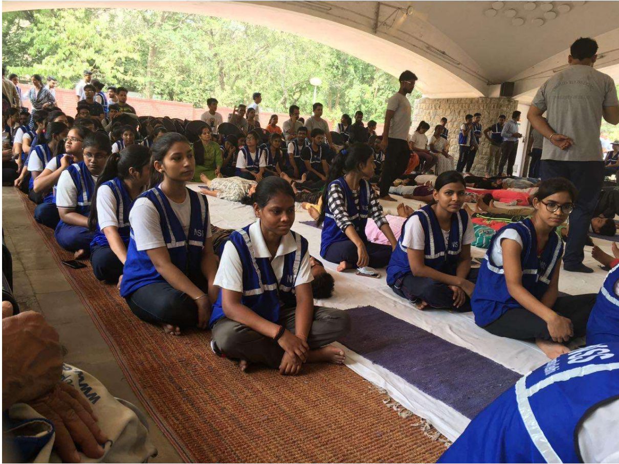
At NSS-DU Centre