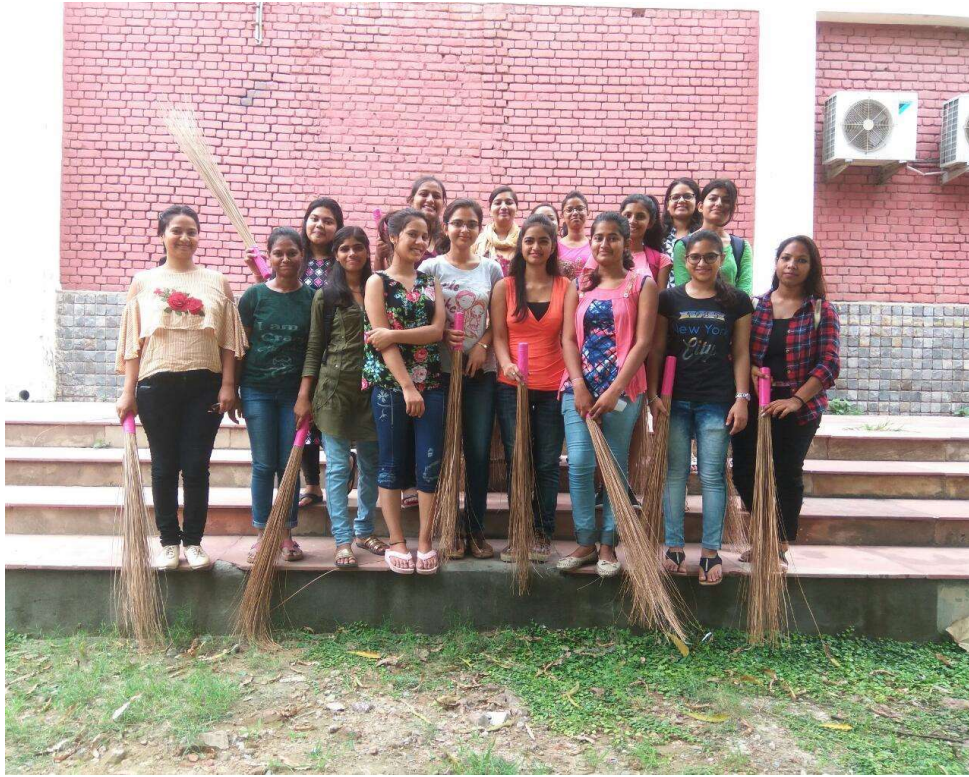
Sweeping around the gymnasium