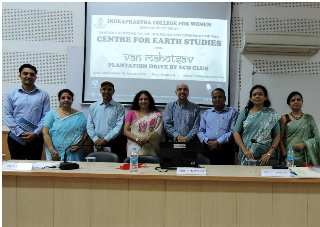
INAUGURATION OF THE CENTRE FOR EARTH STUDIES IN THE CONFERENCE ROOM