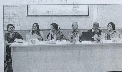
कविता सत्र में शिरकात करते रचनाकार।